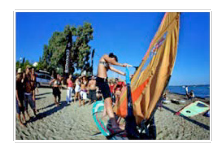
60 girls participated in last year's summer camp classes!