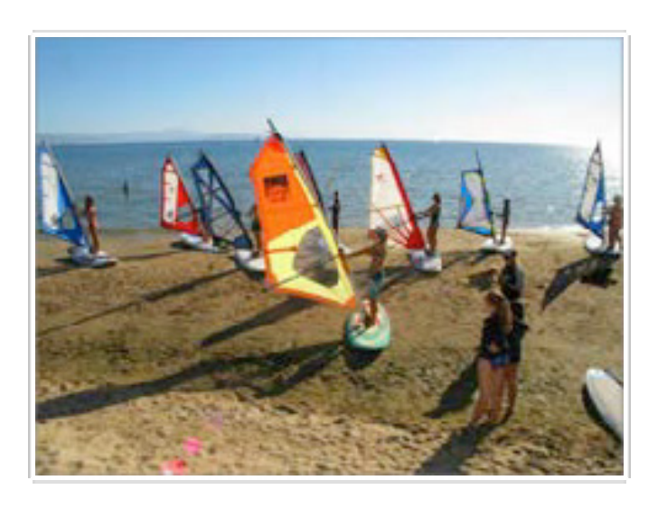
1000 kids participated in <u>last year's</u> summer camp classes!